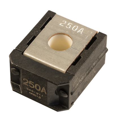
ZCASE Single Mega/Starter Fuse