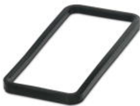
Profile gasket for HEAVYCON EVO supporting base element type B16

Please be informed that the data shown in this PDF Document is generated from our Online Catalog. Please find the complete data in the user's documentation. Our General Terms of Use for Downloads are valid ( http://phoenixcontact.com/download )