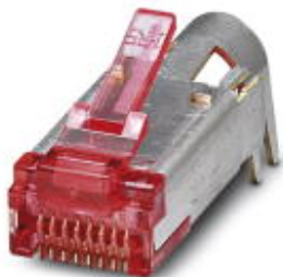
RJ45 male insert, CAT6, 8-pos., shielded, IDC pierce connection, for AWG 27 litz wires ... 24, with strain relief

Please be informed that the data shown in this PDF Document is generated from our Online Catalog. Please find the complete data in the user's documentation. Our General Terms of Use for Downloads are valid ( http://download.phoenixcontact.com )