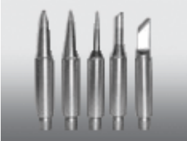
Replacement Soldering Tips H Series

For electronic cleaning applications see our many varieties of swabs.