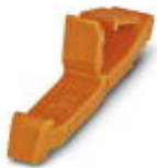
Latching, Color: orange