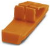
Latching, Color: orange