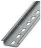
DIN rail, material: Galvanized, perforated, height 7.5 mm, width 35 mm, length: 2 m

DIN rail - NS 35/ 7,5 ZN PERF 2000MM - 1206421