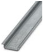
DIN rail, material: Galvanized, unperforated, height 7.5 mm, width 35 mm, length: 2 m

DIN rail - NS 35/ 7,5 ZN UNPERF 2000MM - 1206434