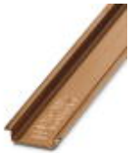
DIN rail, material: Copper, unperforated, height 7.5 mm, width 35 mm, length: 2 m

DIN rail - NS 35/ 7,5 CU UNPERF 2000MM - 0801762