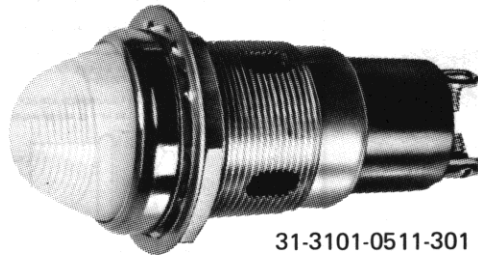
31-3101-0511-301 Torpedo lens