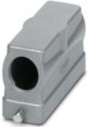
HEAVYCON B24 sleeve housing, for single locking latch, height: 65 mm, with 1 x M25 thread, lateral cable outlet

Please be informed that the data shown in this PDF Document is generated from our Online Catalog. Please find the complete data in the user's documentation. Our General Terms of Use for Downloads are valid ( http://phoenixcontact.com/download )