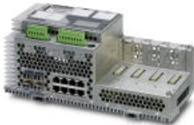
Gigabit Modular Switch with integrated routing function

Ethernet Gigabit Modular Switch with eight 10/100/1000 Mbps RJ45 slots and four 1000 Mbps SFP ports, can be extended by an extension station to up to 28 ports, with integrated routing function